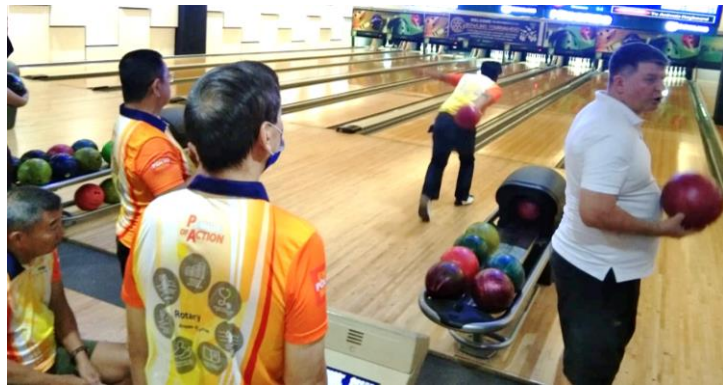
Rotary Inter-club Bowling Tournament Championship... Nov. 20, 2022 at SM Lanang